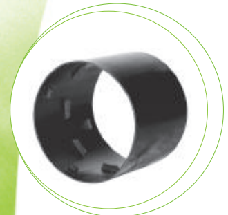
3" - 10" External Snap Coupler