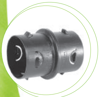
3" - 8" Internal Snap Coupler