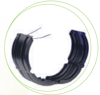
3" - 24" Split Band Coupler

**Pipe O.D. values are provided for reference purposes only, values stated for 3- through 24-inch are \pm 0.5 inch. Contact a sales representative for exact values.